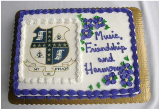
The lovely and delicious Mu Phi Epsilon cake.

... hosted by the Ann Arbor Alumni chapter